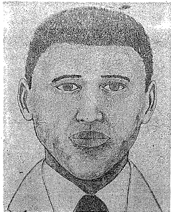
A composite sketch of the suspect in two slayings.