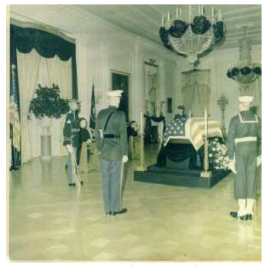
JFK Death Watch in the White House

Assignment as White House Door "Greeters"